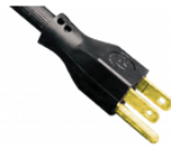
5-15P Straight Blade