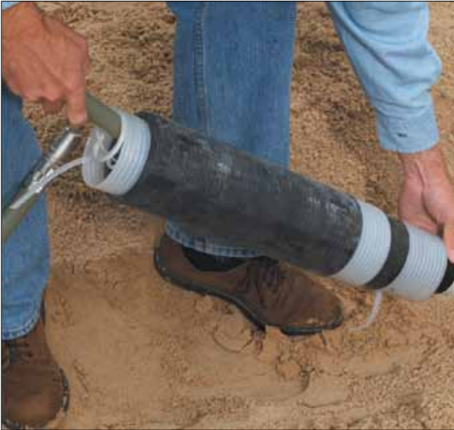
1. Prepare cable and make connection. Position 3M™ Cold Shrink Silicone Rubber Splice QS-III components