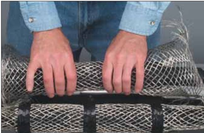
3. Re-shield Splice