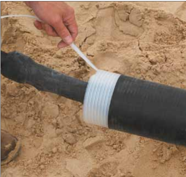
3. Re-jacket Splice