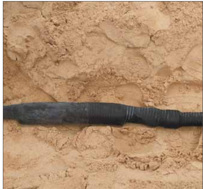
4. Completed Splice