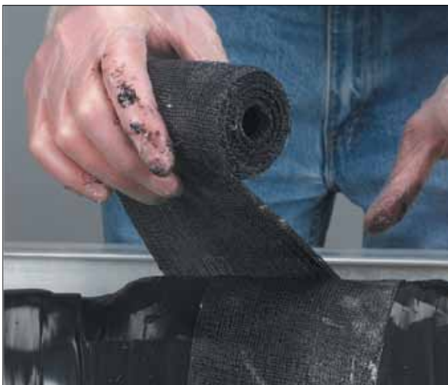
5. Re-jacket/Re-armor Splice