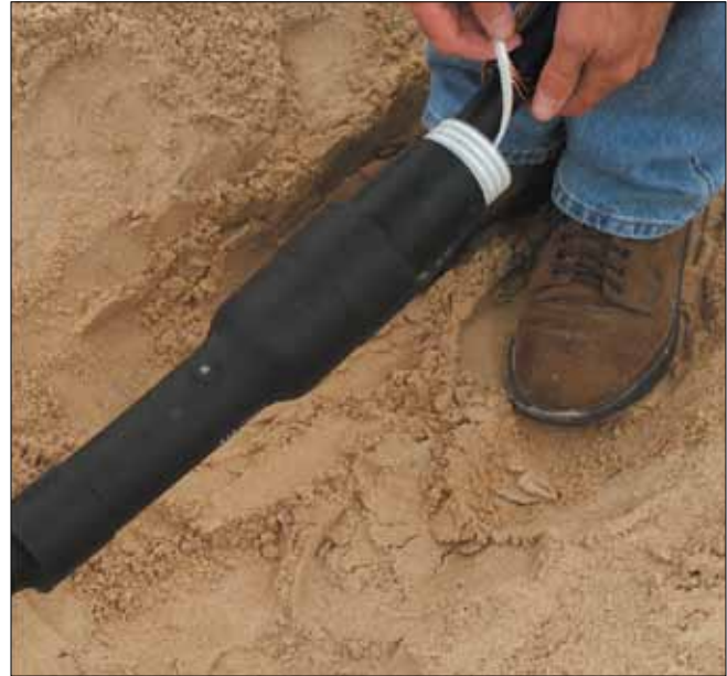
2. Position splice and unwind core