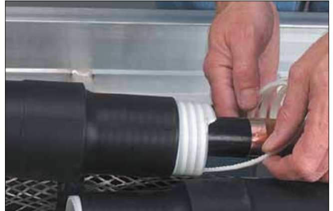
2. Position splice and unwind core