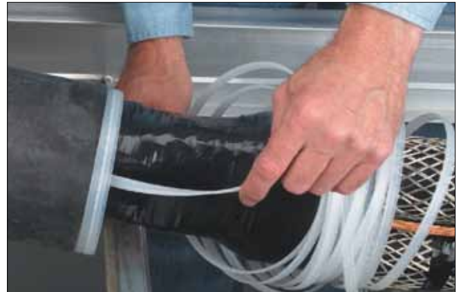
4. Re-jacket Splice