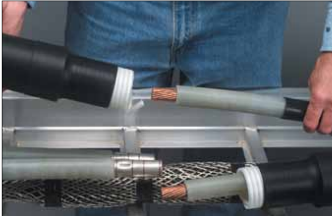
1. Prepare cable and make connection. Position 3M™ Cold Shrink Silicone Rubber Splice QS-III components