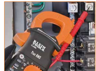
Test Lead Holder

▲WARNING: Read, understand, and follow all instructions, cautions and warnings attached to and/or packed with all test and measurement devices before each use.