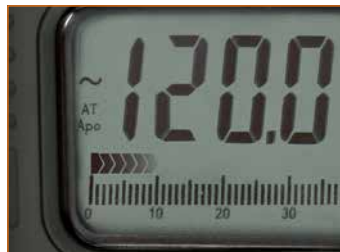
Analog Bar Graph