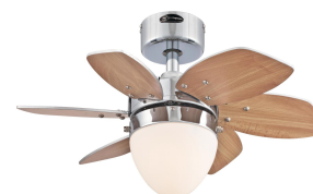
Reversible Beech Finish Blades