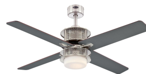
Reversible Graphite Finish Blades