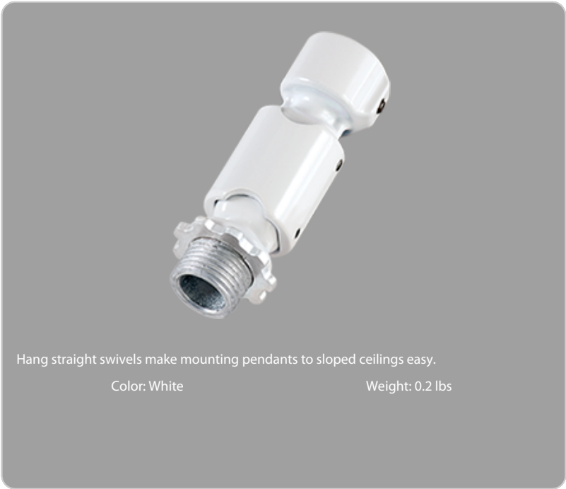
Hang straight swivels make mounting pendants to sloped ceilings easy. Color: White Weight: 0.2 lbs