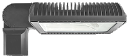
Color: Gray Weight: 32.5 lbs