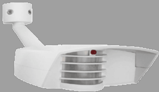
STEALTH Sensor with 110° view. Double Look Down lens, surge protection, LED detection indicator and Color Matched Lens.