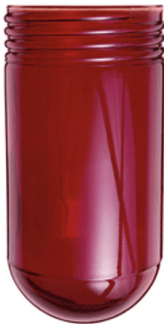
Threaded glass globes fit RAB and other standard Vaporproof fixtures and Lawn Lights Color: Ruby Weight: 1.5 lbs