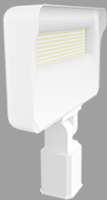
General purpose lighting that's pocket friendly. Color: White Weight: 10.1 lbs