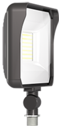
Small, general purpose lighting that's pocket friendly. Color: Bronze Weight: 3.4 lbs