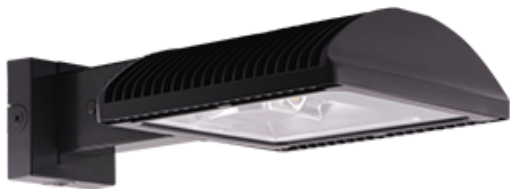
Color: Bronze Weight: 34.8 lbs