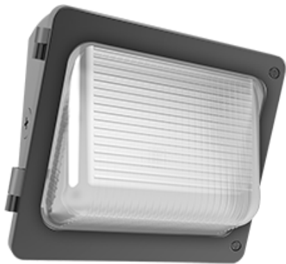
Ultra-economy wall pack with traditional look. Color: Bronze Weight: 7.4 lbs