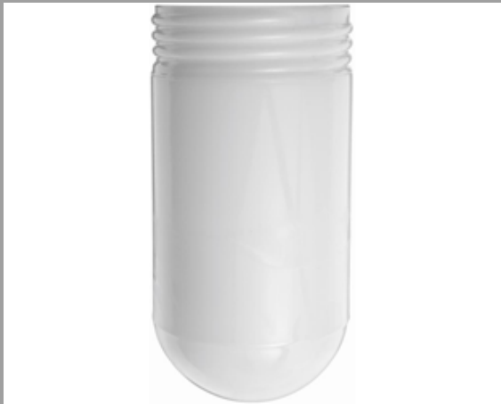
Threaded glass globes fit RAB and other standard Vaporproof fixtures and Lawn Lights Color: White Weight: 1.0 lbs