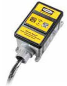
Automatic Reset GFCI