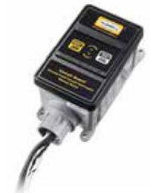
Manual Reset GFCI