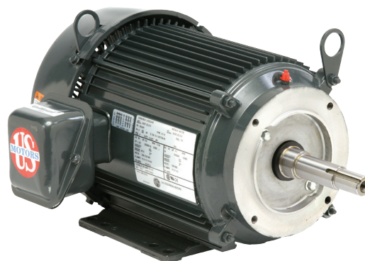
UNIMOUNT® 125 Motor