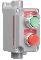
Double Push Button (Box and Cover)