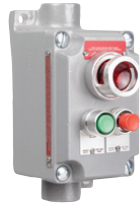
Pilot Light Two Mini Push Buttons (Box and Cover)

Class I, Div. 1 & 2, Groups C, D Class I, Zones 1 & 2, Groups IIB, IIA Class II, Div. 1 & 2, Groups E, F, G Class III NEMA 7 (C, D) 9 (E, F, G)