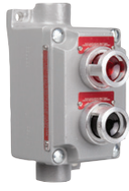
Double Pilot Light (Box and Cover)