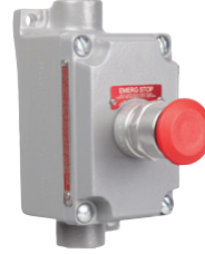
Push-Pull Mushroom Maintained Push Button (Box and Cover)

Class I, Div. 1 & 2, Groups C, D Class I, Zones 1 & 2, Groups IIB, IIA Class II, Div. 1 & 2, Groups E, F, G Class III NEMA 7 (C, D) 9 (E, F, G)