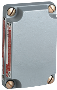
X-10 Blank Cover