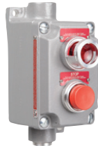
Pilot Light Push Button (Box and Cover)