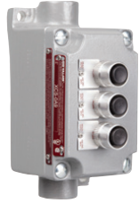
Three Mini-Push Button (Box and Cover)