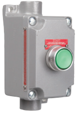
Single Push Button (Box and Cover)