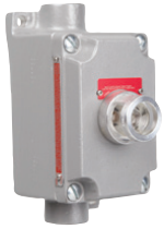
Pilot Light (Box and Cover)