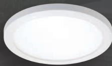
Surface LED Luminaire