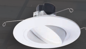
LED Adjustable Downlight