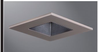
3011SNBB Satin Nickel with Black Baffle