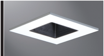
3011WHBB White with Black Baffle