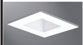
3011WHWB White with White Baffle