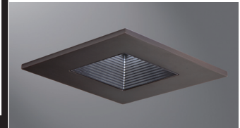
3011TBZBB Tuscan Bronze with Black Baffle