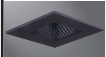
3011BKBB Black with Black Baffle