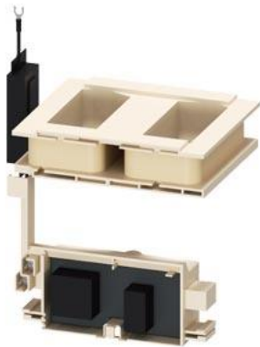
Magnet coil with switch-on electronics for contactor 3TF6844-.C..., 200...240 V AC 50/60 Hz