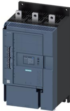
SIRIUS soft starter 200-480 V 210 A, 110-250 V AC Screw terminals Analog output