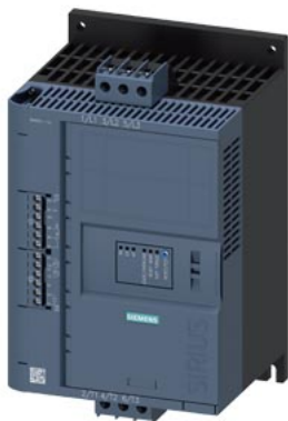
SIRIUS soft starter 200-480 V 38 A, 110-250 V AC Screw terminals Analog output