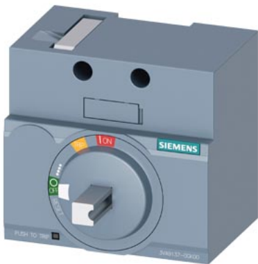
rotary operator with shaft stub for 8UC retrofit accessory for: 3VA5 125