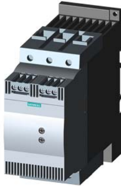
SIRIUS soft starter S3 80 A, 45 kW/400 V, 40 °C 200-480 V AC, 110-230 V AC/DC Screw terminals