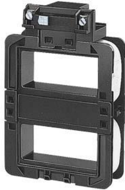
Magnet coil with switch-on electronics for contactor 3TF6844-.C..., 380...460 V AC 50/60 Hz