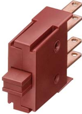
Contact block, 1 NC, flat connector terminal