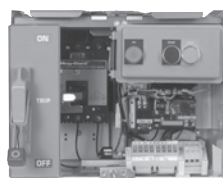
Model 6 Unit