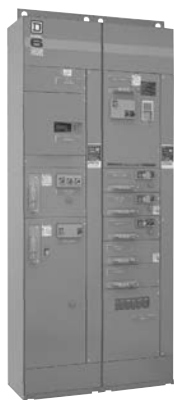
Model 6 Motor Control Center