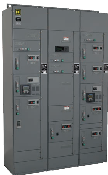
Model 6 Motor Control Center