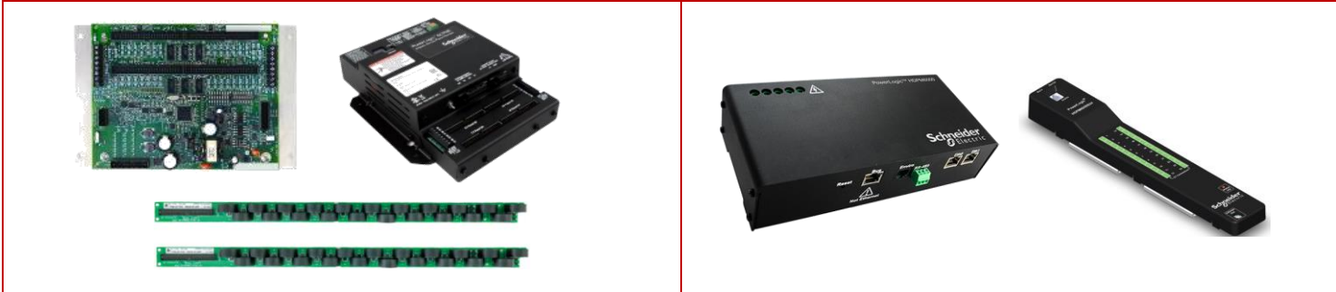
Current Product: BCPM / BCPME