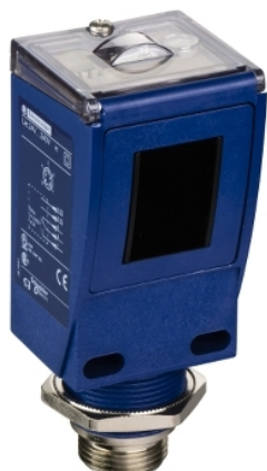
photo-electric sensor - XUC - BGS - Sn 1.2m - 24..240VAC/DC - 7/8"