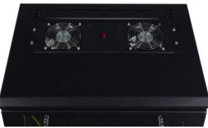
AR8213 Fan tray