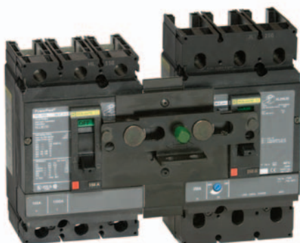
H-frame and J-frame Circuit Breakers Interlocked with a S29354 Interlocking System

The S32614 mechanically interlocks L-frame circuit breakers. The S29354 interlocks H-frame circuit breakers, J-frame circuit breaker, or a combination of the two, providing the ability to interlock circuit breakers of different ampacities.