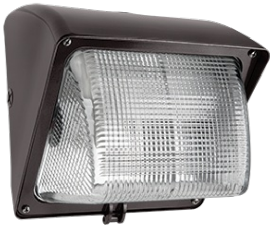
Color: Bronze Weight: 9.2 lbs