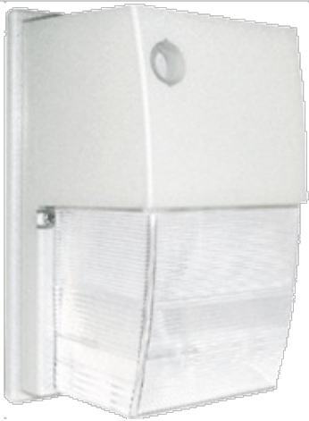
Tallpack Compact Fluorescent Quad Tap with Emergency Battery Backup