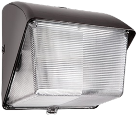
Wallpack CFL 120V with Emergency Battery Backup. Lamp supplied. Color: Bronze Weight: 10.5 lbs