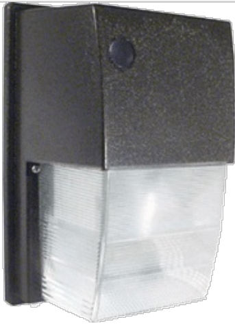
Tallpack Compact Fluorescent Quad Tap with Emergency Battery Backup