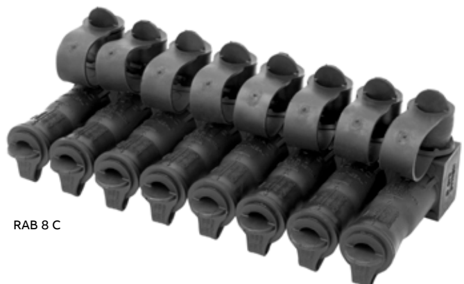
RAB 8 C