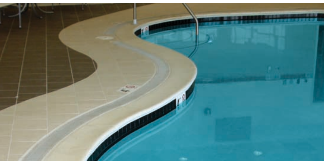
Above Right: Dura Slope Radius Coupling Installation Middle & Left: Finished Pool Drain