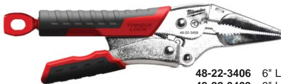
48-22-3406 6" Long Nose 48-22-3409 9" Long Nose