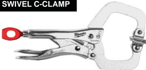
48-22-3521 11" Swivel C-Clamp 48-22-3522 6" Swivel C-Clamp

NOTE: As an aid to installing a service replacement spring onto a TORQUE LOCK™ clamping device, draw back the Adjustment Bolt (1) to allow for the end of the middle pivot plate in the lower handle assembly to be freed through the round opening in the upper handle. Expand open the lower handle assembly as shown.