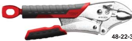
48-22-3405 5" Curved Jaw 48-22-3407 7" Curved Jaw 48-22-3410 10" Curved Jaw