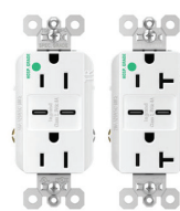
Trademaster® 15A & 20A Tamper-Resistant Hospital-Grade Ultra-Fast USB Type-C/C Receptacle

WRTR15USBAC6X Brown, BK, GRY, I, LA, W WRTR20USBAC6X Brown, BK, GRY, I, LA, W