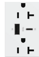
adorne® 20A Tamper-Resistant Ultra-Fast USB Type-A/C Outlet

TR15USBCC6X Brown, BK, GRY, I, LA, W TR20USBCC6X Brown, BK, GRY, I, LA, RED, W