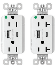
PlugTail® 15A & 20A Hospital-Grade Tamper- Resistant USB Type- A/C Receptacle

3.1A charging capacity between both ports.