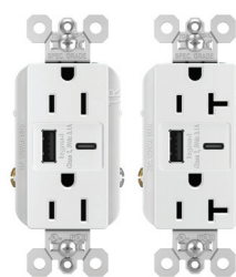
Trademaster® 15A & 20A Tamper-Resistant USB Type-A/C Receptacle

TR20HUSBACX Brown, BK, GRY, I, LA, RED, W