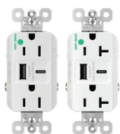
Trademaster® 15A & 20A Tamper-Resistant Hospital-Grade Ultra-Fast USB Type-A/C Receptacle

6A charging capacity; 5V output; 15W per port.