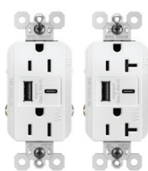
Trademaster® 15A & 20A Tamper-Resistant Weather-Resistant Ultra-Fast USB Type-A/C Receptacle

TR15USBAC6X Brown, BK, GRY, I, LA, W TR20USBAC6X Brown, BK, G, GRY, I, LA, NI, RED, W