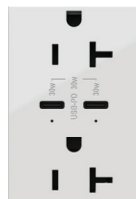
adorne® Ultra-Fast Plus Power Delivery USB Type-C/C Outlet Module

TR20USBPDX Brown, BK, DB, G, GRY, I, LA, NI, RED, W