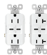
Trademaster® 15A & 20A Tamper-Resistant Ultra-Fast USB Type-C/C Receptacle

TR15HUSBCC6X Brown, BK, GRY, I, RED, W TR20HUSBCC6X Brown, BK, GRY, I, LA, RED, W