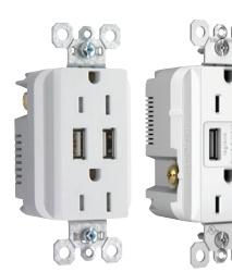
Trademaster® 15A & 20A Fed Spec-Grade Tamper-Resistant USB Type-A/A Receptacle

TR20USBACX Brown, BK, GRY, I, LA, NI, RED, W