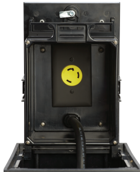
30 amp, 250V Turnlok® locking receptacle L6-30R