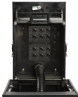
2-gang low voltage box (shown with communications options)