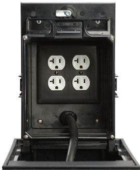
2-gang, 20 amp duplex receptacles (Available in single or two circuit versions)

The Outdoor Ground Box comes in three finishes to complement any outdoor space. It's available in a host of configurations to suit your needs.