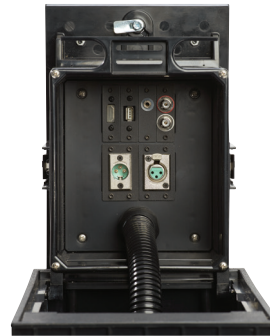
2-gang low voltage box (shown with audio/video devices)

Ground Boxes are also available with the following receptacles: