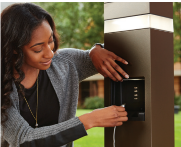
Outdoor Charging Station