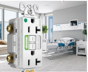
Hospital Grade GFCI with Power Indication