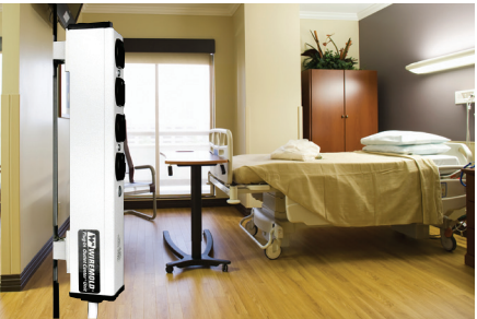
Hospital Grade Plug-In Outlet Centers

Create a patient-friendly environment that is comfortable and connected. Our solutions help to safely power prep your clinic rooms so you can focus on the connection that matters most – you and your patient.