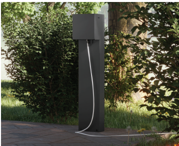
Outdoor Power Pedestal