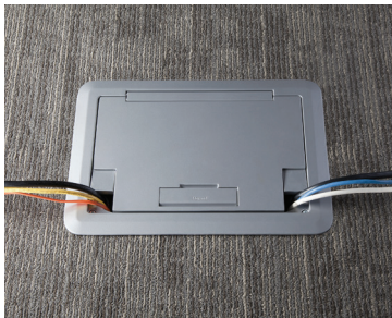
Evolution™ Floor Boxes