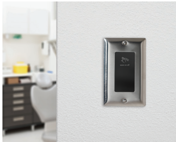
Commercial Wave Switch