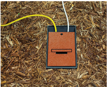
Outdoor Ground Box

Whether it's a patient spending time in a healing garden or a doctor stepping outside for some revitalizing fresh air, Legrand can seamlessly meet your outdoor wiring and power needs so your healthcare facility can foster a healing environment both inside and out.