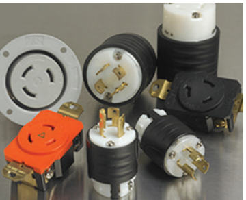
Turnlok® Locking Plugs and Connectors