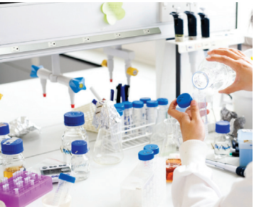
Plugmold® Multioutlet Systems

Make workstations and labs work for you. A range of our solutions help support your healthcare team by reducing eye-strain to provide real-time access to patient information.