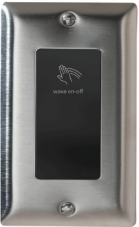
Commercial Wave Switch