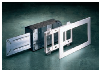
Behind the low-profile exterior of WallSource lies a rugged in-wall box with more than enough room for all your wiring needs.

The result: an in-wall wiring box that's ready for any wiring scenario - and can make it happen on a moment's notice. The new WallSource multiple service box. Another breakthrough wiring solution from Wiremold, the wire and cable management experts.