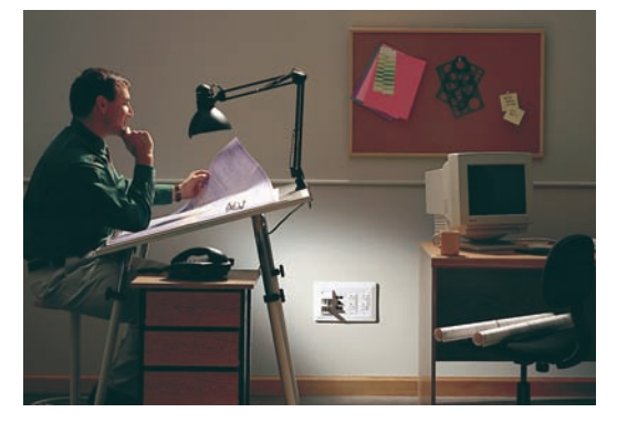
Workplaces today go through a lot of changes. With the WallSource multiple service box, your walls don't have to.