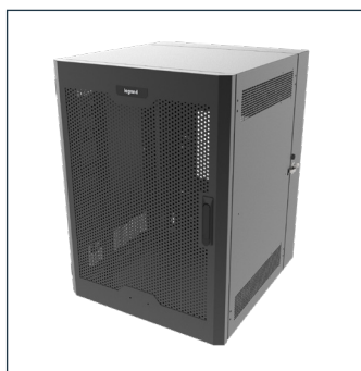
Perforated Front Door