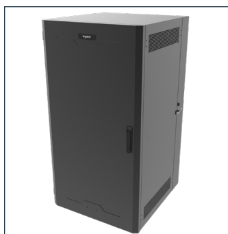
Solid Front Door