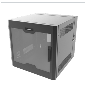
Plexiglas Front Door