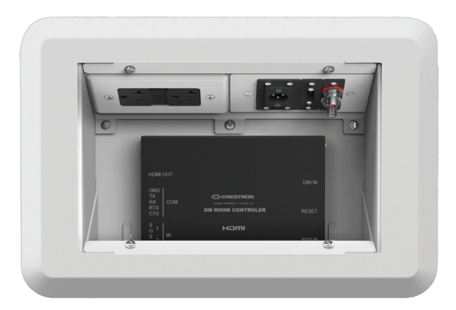
EFSB2 (2-gang open system)

Wiremold introduces the newest addition to the highly successful Evolution Series. New Evolution Series Wall Box. Just like the rest of the series, these new boxes bring power, communications and A/V where you need it most. Delivering outstanding flexibility and functionality. As well as stylish good looks.