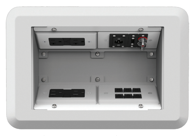
EFSB4 (4-gang open system)