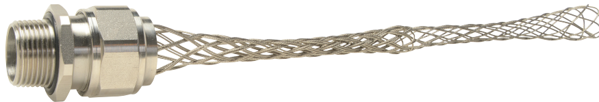
Stainless Steel Cord Grip with Stainless Steel Mesh