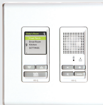
Intercom Room Unit (IC5000-XX)

Built on Cat 5 cabling, the Selective Call System includes convenient RJ45 connections and system auto-discovery.