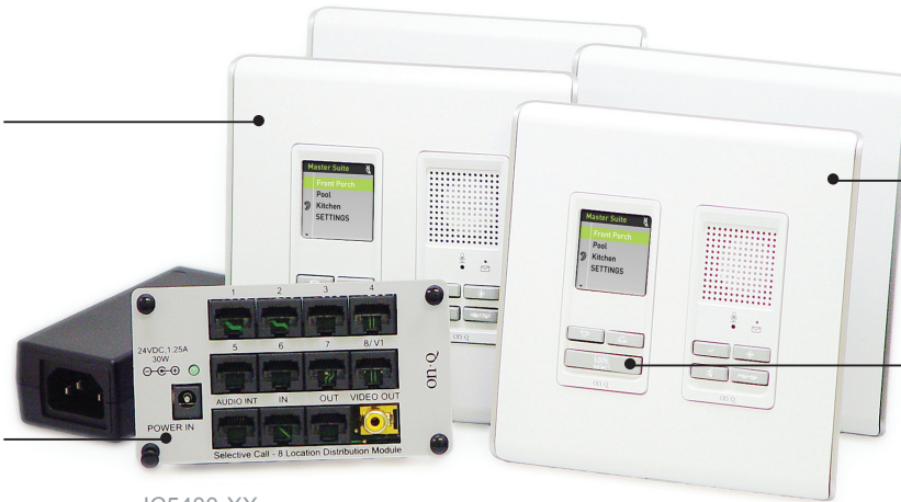
IC5400-XX Selective Call Intercom 4-Location Kit

Installation based on Cat 5 wiring is easy and efficient.