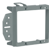
AC1009-02, PLV2B or SLV2B