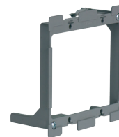
AC1010-02, PLV2W or SLV2W