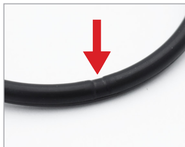
Brass Fittings, Unions, & Wrot Copper