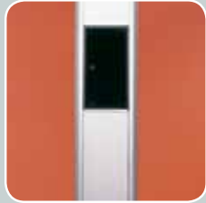
Poles & Columns