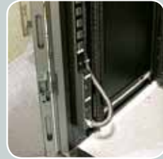
Power Distribution & Surge Protection