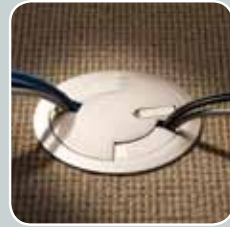
Floor Boxes & Poke-Thru Devices