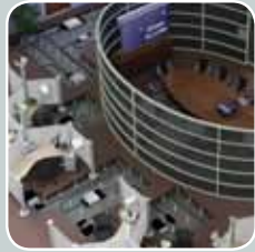
Energy Management Systems