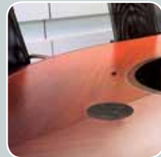
Work Surface Solutions