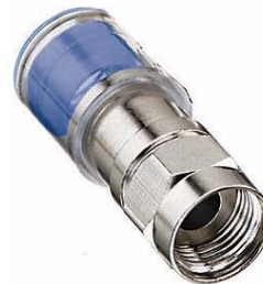
89-044 RG-6 OmniConn™